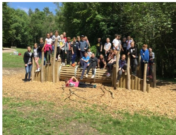
Monkeying around at Go Ape!