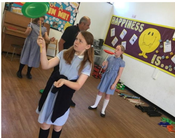
Circus Skills on a Fab Friday.