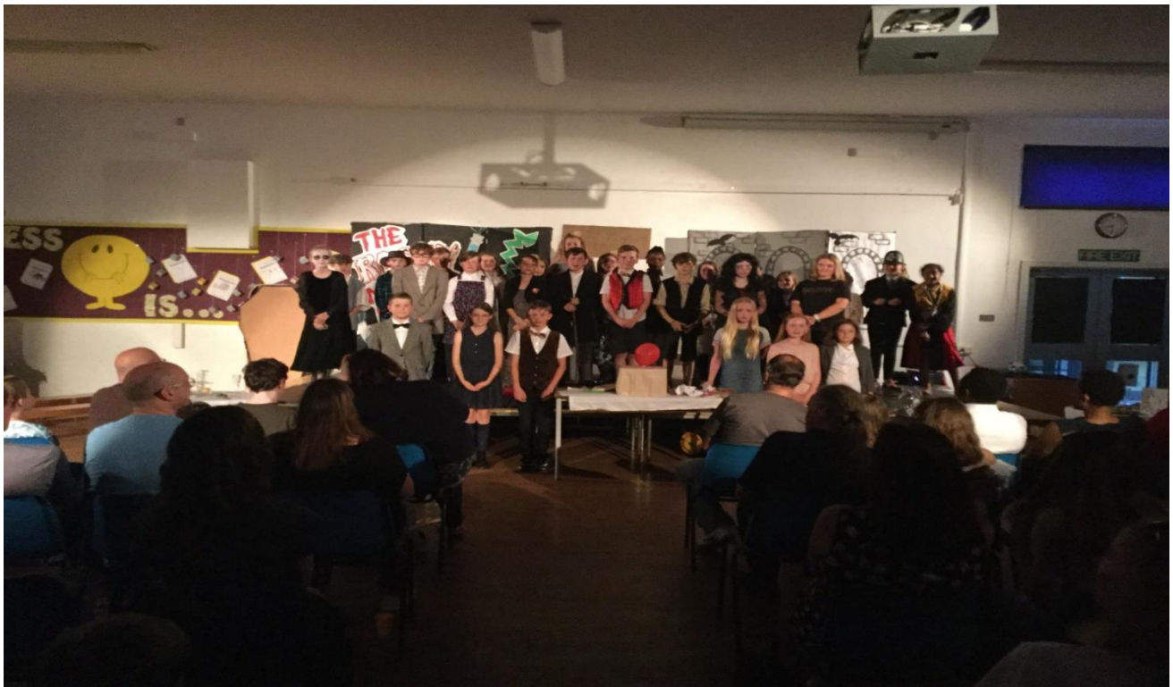
A critically acclaimed performance of 'The Rocky Monster Show'